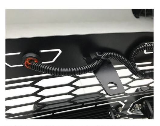
4. Use the supplied amber running light wire harness components to connect each of the (3) lights on top of the grille frame. See harness wire diagram included with components.