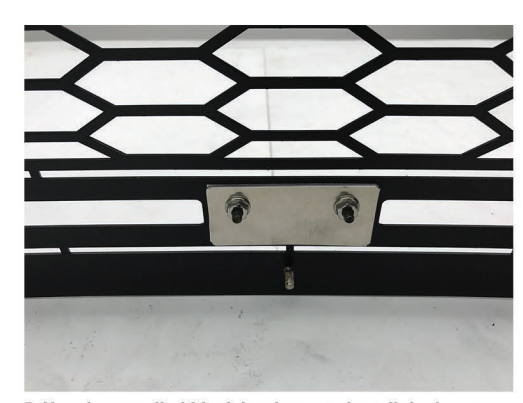
5. Use the supplied black hardware to install the logo back plate.