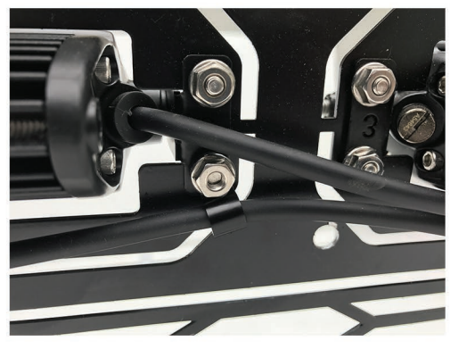
2. If your installation has ZROADZ LED lights use the supplied wire clip on (1) each of the lower side mounting screws as shown to retain the cable.