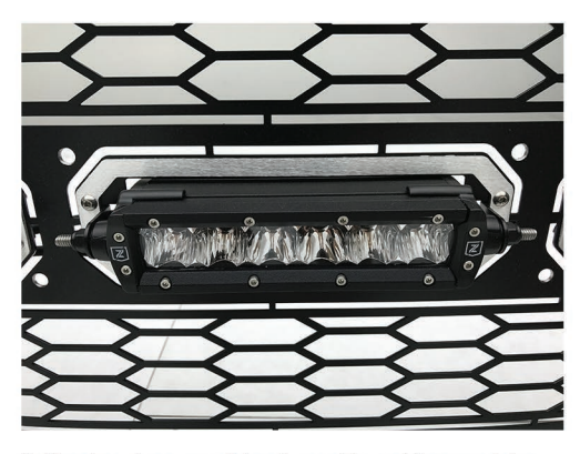
3. Check and secure all hardware. Repeat for remaining light openings.