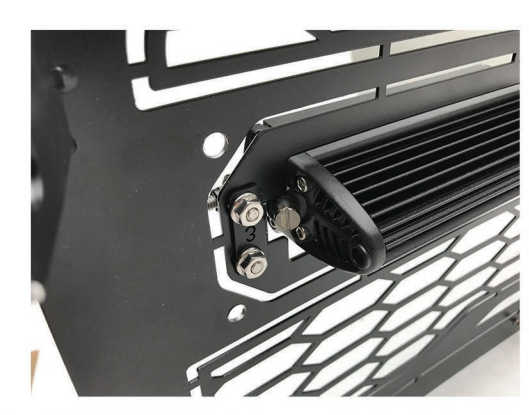
1. Install the supplied trim with hardware. If your installation has ZROADZ LED lights start on one side of each of the (4) openings. Install the trim on the front and the bracket on the back of the grille as shown.