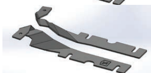
Mounting Brackets Only

* Simulated Rendering, NOT Actual Parts.